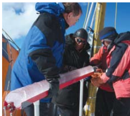
Ice core extracted from the Andes in Bolivia.

such as fluorine, chlorine, or bromine (see Fig. 1)—to increase its density.