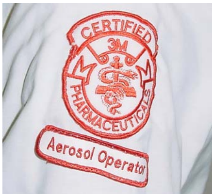
A patch on the uniform identifies a certified technician at 3M Pharmaceuticals.

All pharmaceutical companies are required to demonstrate compliance to company Good Manufacturing Processes (cGMP's) and business success. Detailed job requirements which are derived from job descriptions, are used to measure how well an employee is performing.